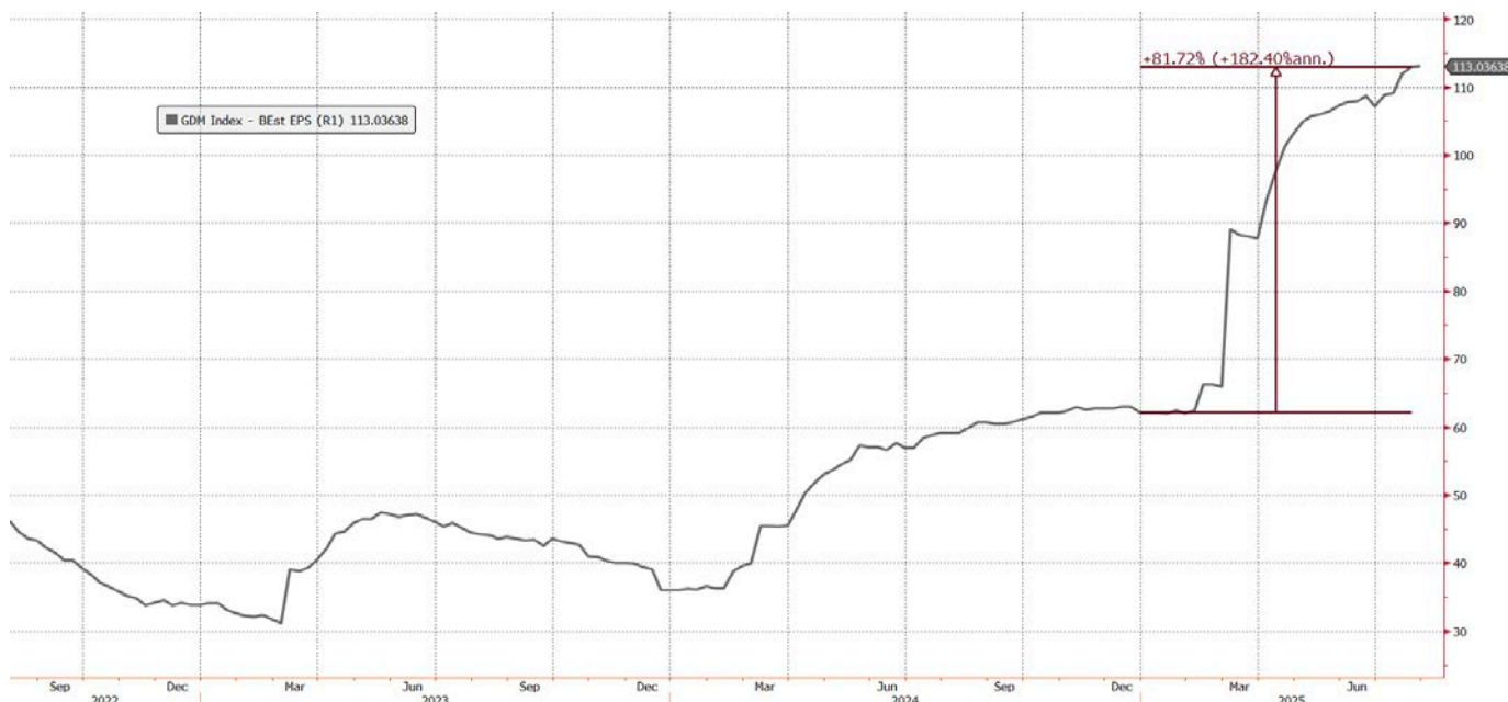
Figure 2. Precious Metal Miners Have Seen Their Earnings Estimate Surge

Data as of July 29, 2025.