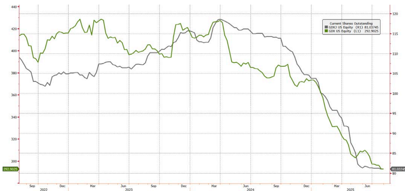
Figure 3. Shares Outstanding for GDX and GDXJ Continue to Decline Despite Stronger Fundamentals

Data as of July 29, 2025.