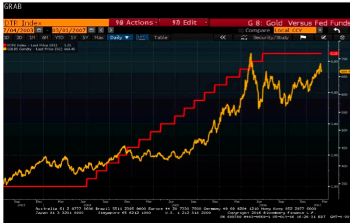
Figure 4: Spot Gold Versus Upper Band of Fed Funds Target Rate (7/4/03-3/1/07)