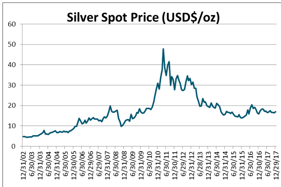
Spot Silver Price (US$/oz) (December 31, 2002 – December 29, 2017) (1)

Fluctuations in the price of silver are expected to influence the price of the units. Investors should be aware of the historical movements in silver prices and understand what events and forces may have caused these movements to occur. The following chart illustrates the changes in spot silver prices from December 31, 2002 through December 29, 2017: